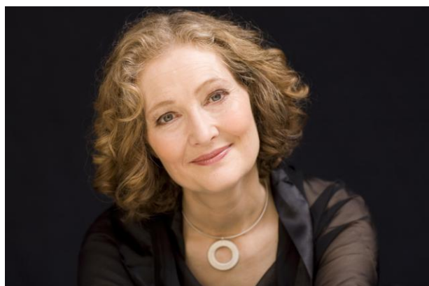
Dame Emma Kirkby